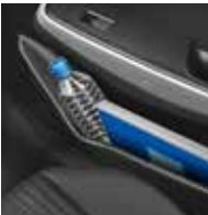
Front door pocket