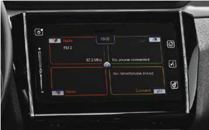
*Optional for GLX

For your entertainment, the Dzire comes with a highly advanced Smartphone Linkage Display Audio, which lets you stay connected to excitement, at every moment. It works with Apple CarPlay for your iPhone, or Android Auto™ or MirrorLink™ for your compatible smartphone.