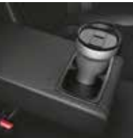
Rear armrest with cup holder