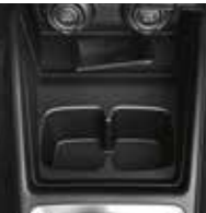
Front console box and cup holders

*Measured using the German Association of the Automotive Industry (VDA) method.