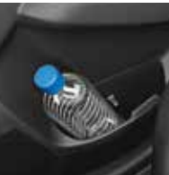
Rear door pocket