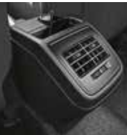
Rear console tray and 12V accessory socket (Only in GLX, GL)